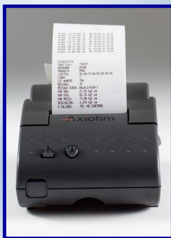
Mini printer (Optional)