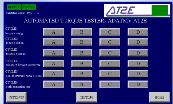
6 cycles available – satisfy various of products test request