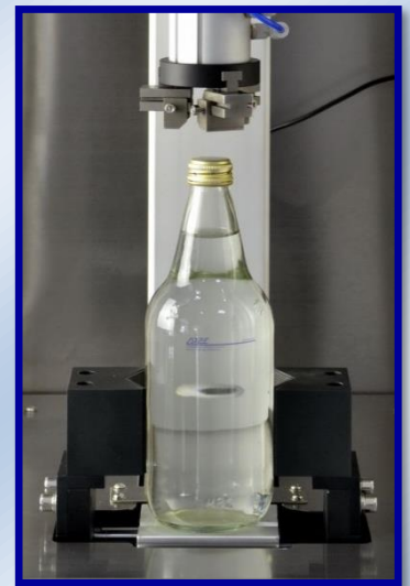
Automated Clamping system & Customized clamps