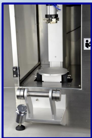
Calibration pack (Optional)