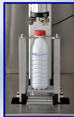
Automatic squeezing clamping system for PET packaging (Optional)