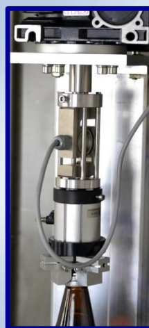
Dynamometric system (Optional)