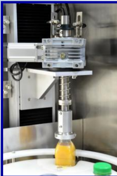
OPENING - CLOSING HEAD WITH CONE OR 3 JAWS PNEUMATIC CHUCK