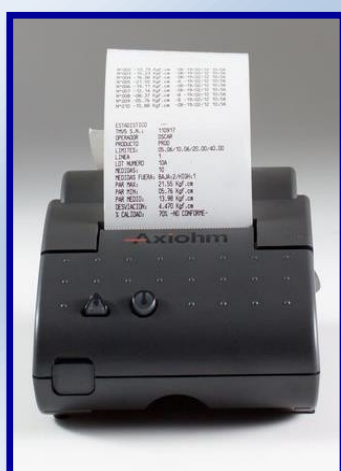
Mini printer (Optional)