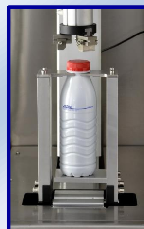
Automatic squeezing clamping system for PET packaging (Optional)