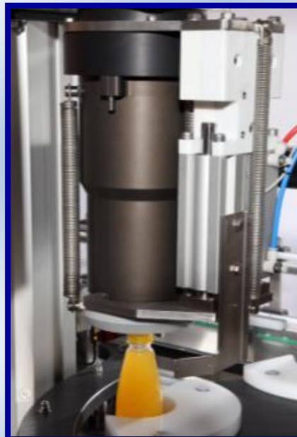
OPTIONAL MODULE AUTOMATIC " BUBBLE POINT "