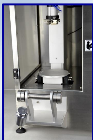
Calibration pack (Optional)