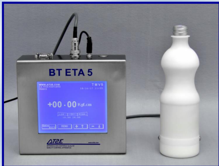
Stainless Steel Box

Our Torquemeters are designed with a special mechanical system for measuring torque which cancels most non-coaxial and top load influences on the measurement. These features cancel most operator influences on the measurement for maximum repeatability.