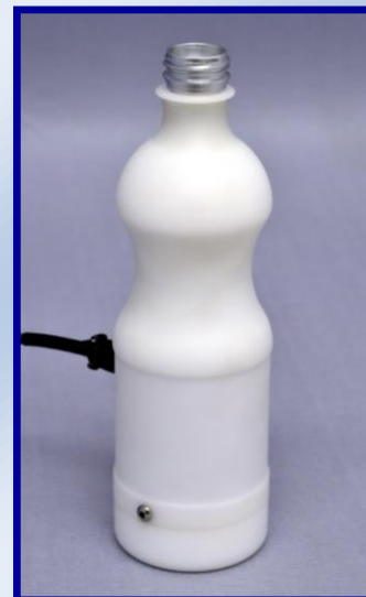
Bottle realized on measure