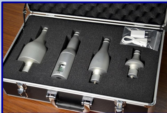
BT ETA FORCE Pack Single sensor for different bottle format replacing