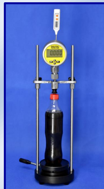
CO 2 EASY-D with digital pressure indicator