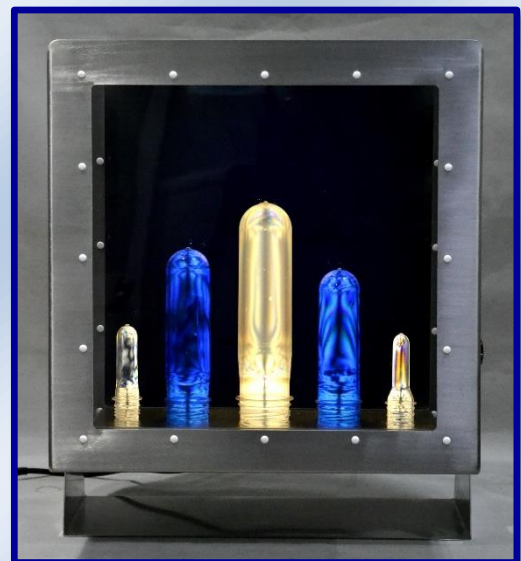
Optional for viewing area 350 x 350mm

With angle adjusting design, operator can view the preform as their most convenience angle. And with the upgraded wider viewing area and sample platform, more preforms could be placed and viewed in the same time. It also frees the hands of operator.