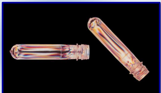
Parallel view and 45° view of preform by PL-2