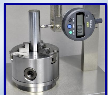
Calibration column (Optional)