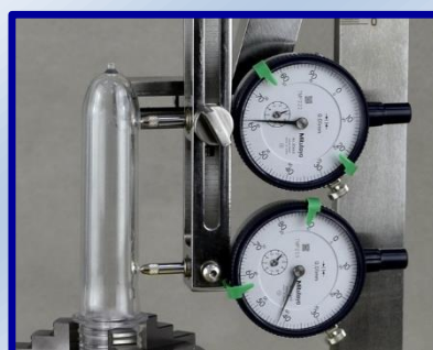
PPG-A with analog gauge