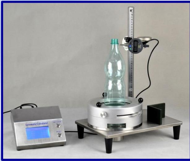
UBPT-1 for PET Bottle