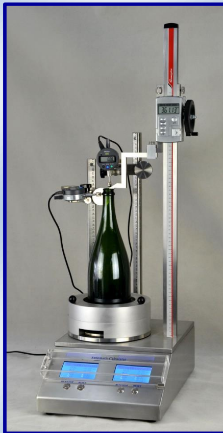
UBPT-3 with 3 measuring heads (for mouth clearance, perpendicularity & height) and integrated double automatic calculators