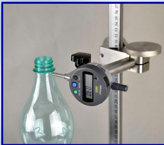
Ruler allows accurate measuring

It’s applicable for various sizes of bottle with the special design of clamping and rotatory system. With automatic calculator, data can be sent to the calculator and read easily. The MAX, MIN, and SAD (Sum of absolute difference between “MAX” and “MIN”) values will be displayed on the calculator which is very convenient for the operator.