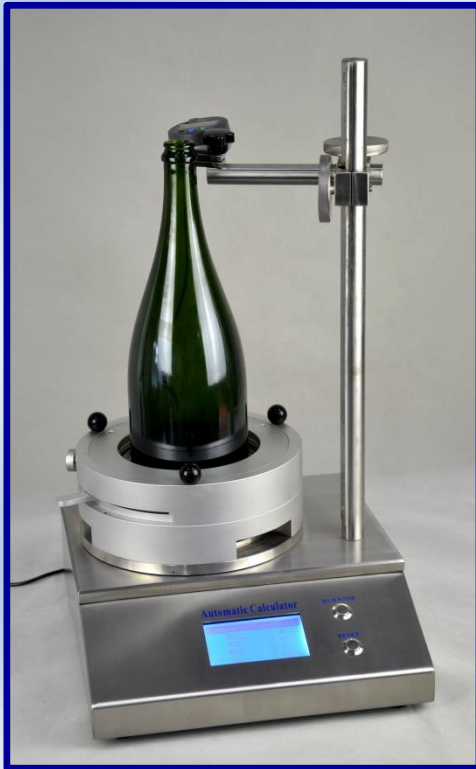
UBPT-1S with integrated automatic calculator