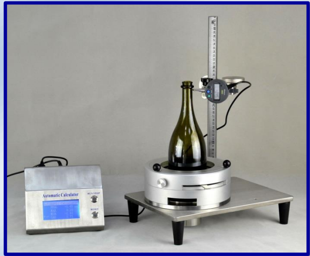
UBPT-1 for Glass Bottle

“UBPT” Universal Bottle Perpendicularity Gauge is used to measure the perpendicularity (deviation) of bottle and it’s a standard equipment for packaging and beverage industries.