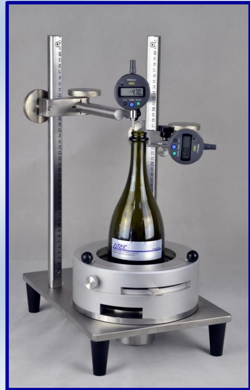
UBPT-2 with 2 measuring heads (for mouth clearance and perpendicularity)