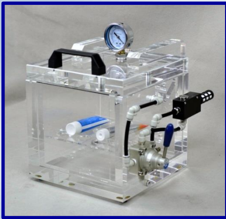
With Vacuum Generator