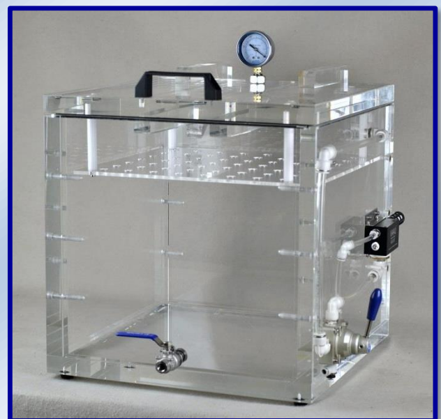
VLT-ECO with immersion system