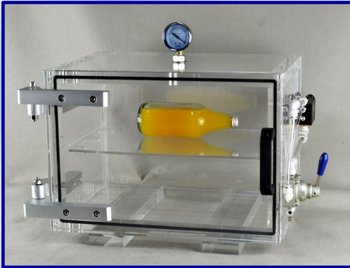
VLT-ECO with shelf