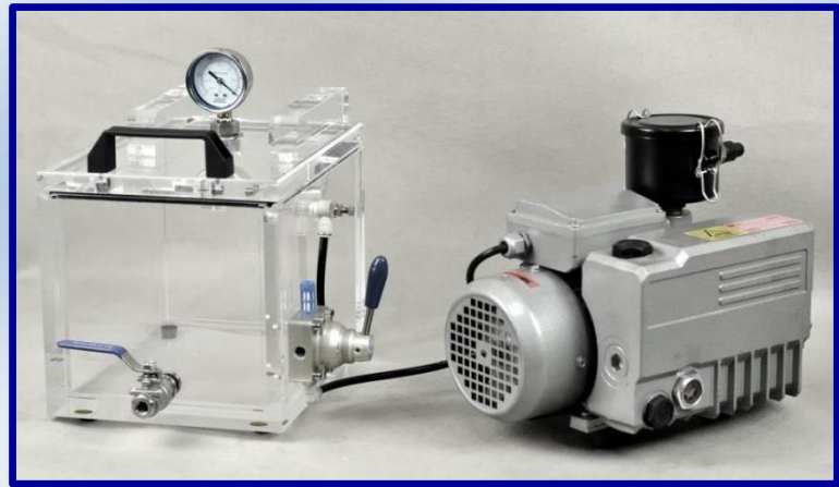
With Vacuum pump