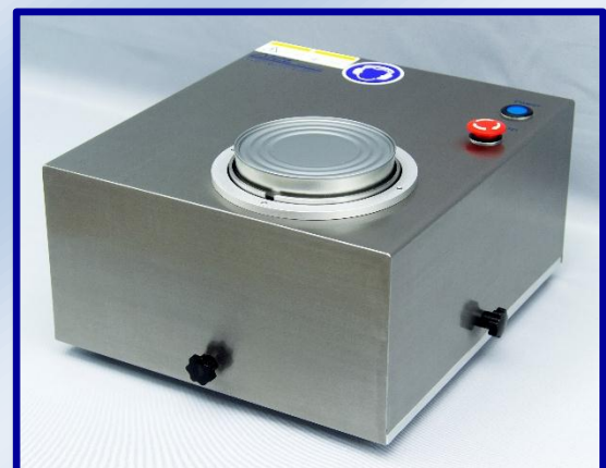
Model SS-2 for vertical cutting is available