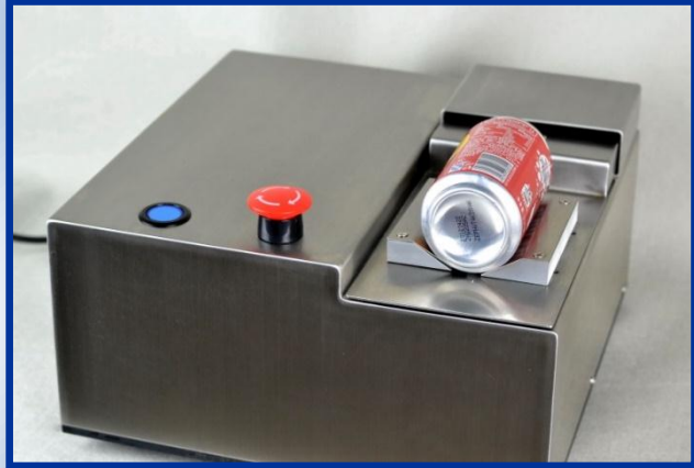
SS-1 Seaming Cutting Saw