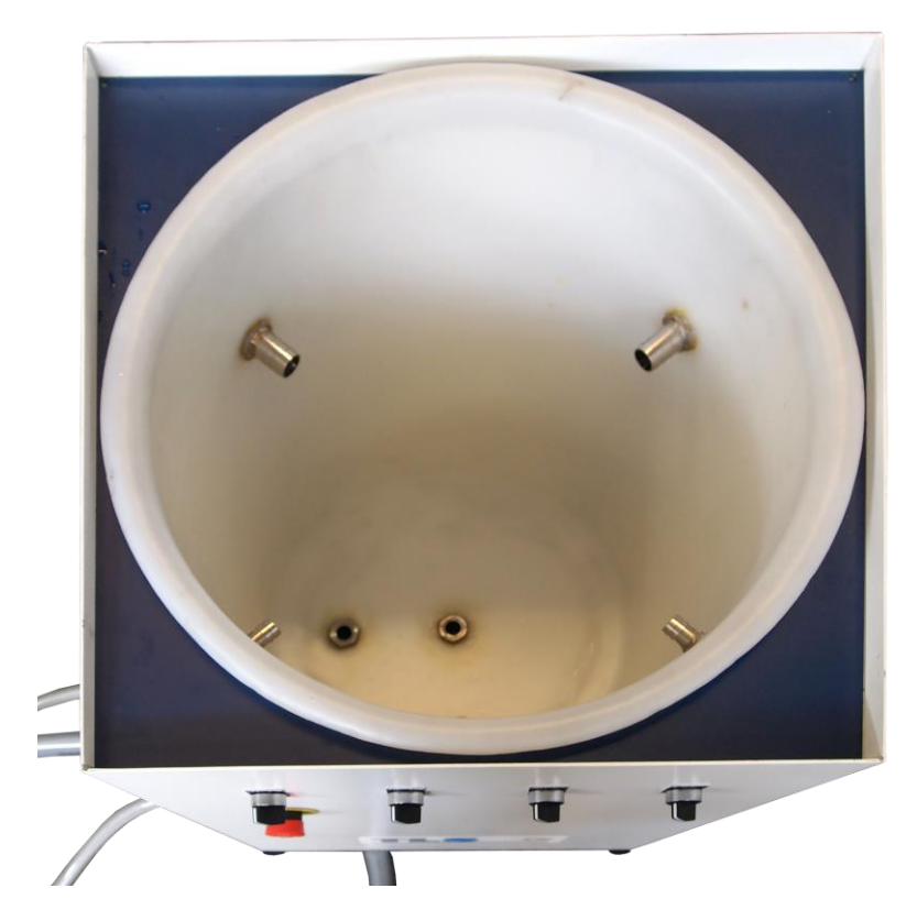
White water tank interior view

POWER SUPPLY: 110V/60Hz or 220V/50Hz single-phase