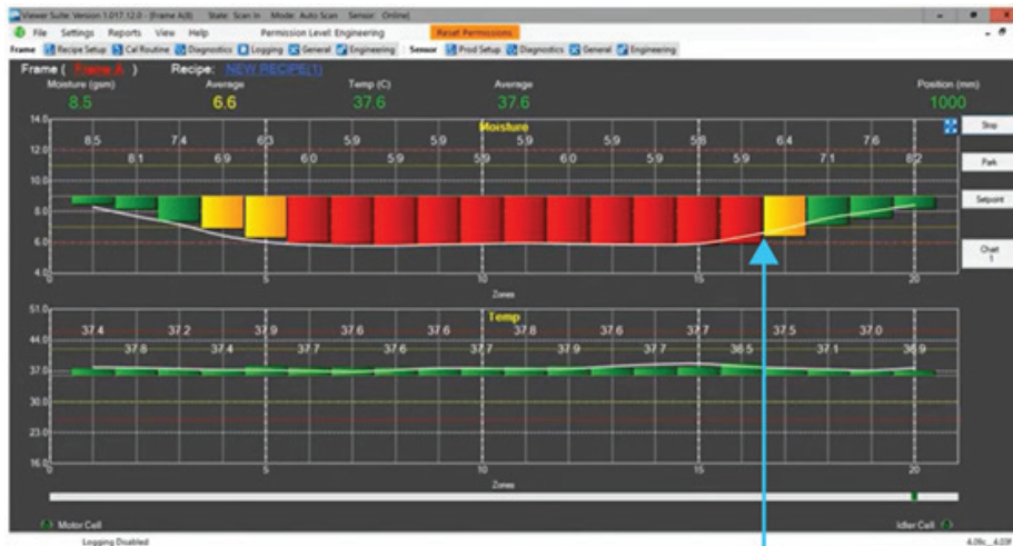
The white line indicates the moisture profile of the last scan