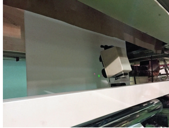
Guardian-HD Scanning Film