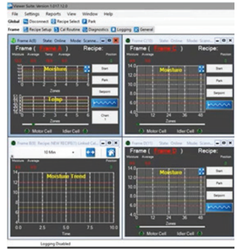
Manage multiple Guardian-HD systems at once