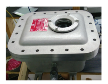
Explosion Proof Enclosure For hazardous Class II Div 1 or Class II Div 2 environments. Operator Interface installed in non-hazardous area.