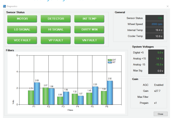
Easy diagnostics page for troubleshooting the MCT460 Series.