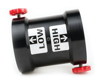
Cal Check Standard Used to verify sensor stability over time and transfer calibrations between sensors.