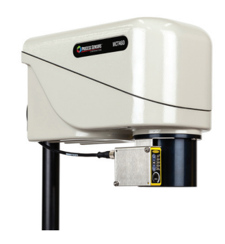
Product Loss Sensor Enables measurements when the product flow is are frequent lulls in the production stream.