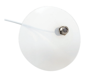
IR Temp Sensor Enables simultaneous product temperature measurement. No additional hardware or wiring is required.