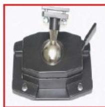
Swivel Base for Water Cooling Jacket Part No. HA22-00