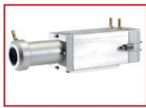
Water Cooling Jacket with Air Purge Part No. KG10-00