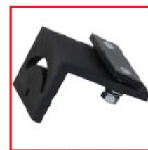
Adjustable Mounting Bracket Part No. HA10-00

Process Sensors IR Temp Sales Office: 787 Susquehanna Ave, Franklin Lakes, N.J. 07417 Tel: (774)-399-0461