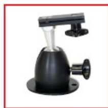
Swivel Base for Metis Sensor Part No. HA20-00