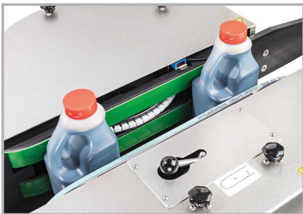
Example plastic containers: from food & beverage to homecare