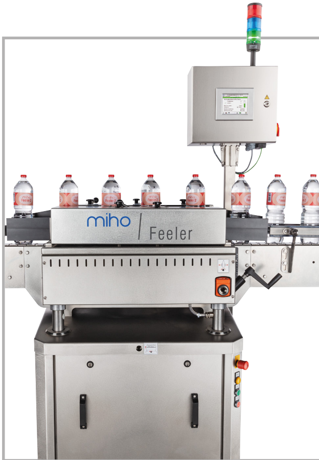
miho Feeler 2