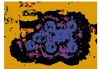
Processed picture of pack: missing bottle detected