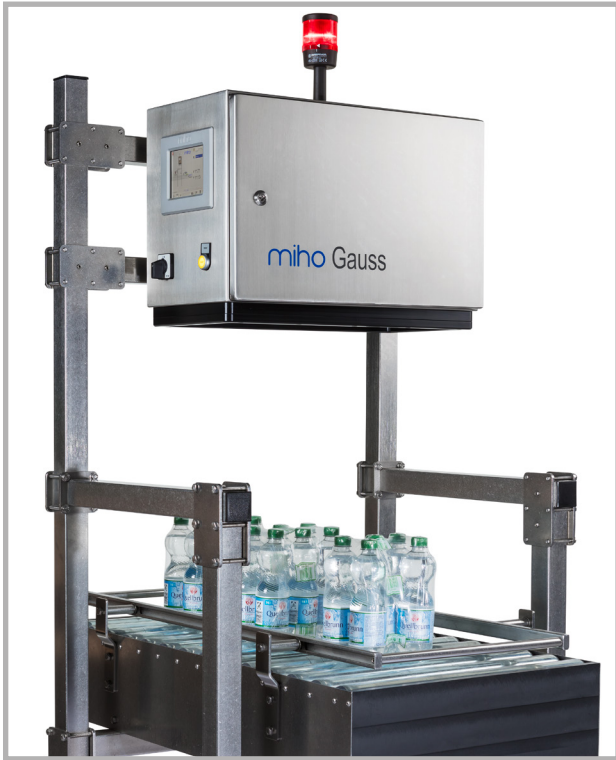
Packing inspection unit miho Gauss P