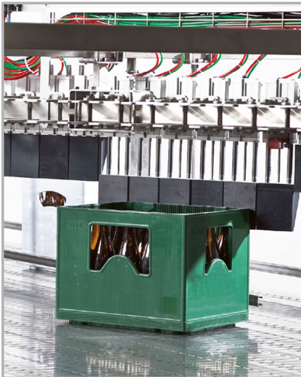
Segment-Ausleitsystem miho Leonardo SK