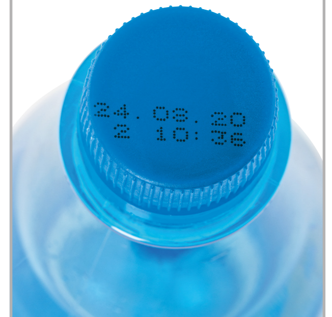
Additional camera module for presence checks of color, logo and print