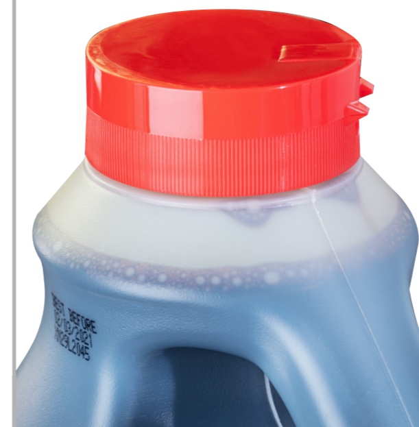
Additional UV-lighting module for print control on PET and special containers (reflected light setting).