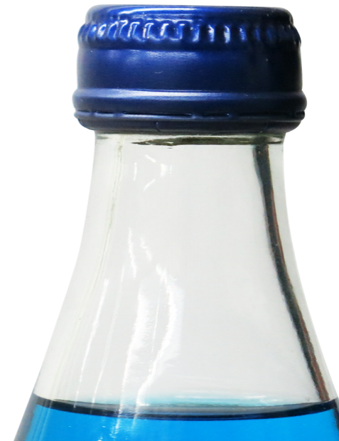
Roll-on check for metal screw caps.