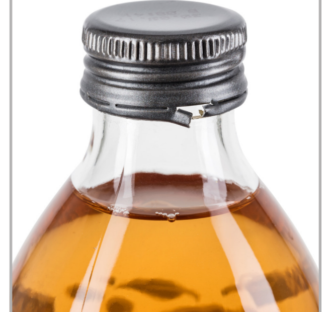
Additional camera module for a 360° inspection; Control for bullnoses, damage to the safety ring, code recognition.