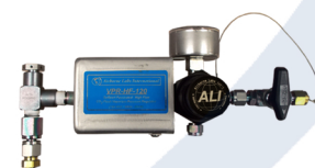
VPR-HF-S Passivated Flash Vaporizer-Pressure Regulator