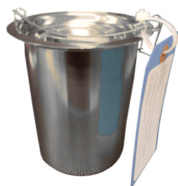
1L Polished NVR Can