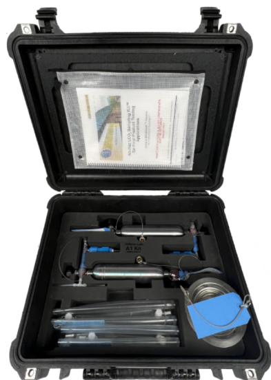
Rugged Shipping Case with Pictorial Instructions + All Return Paperwork