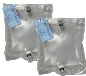
2x 2L Gas Sampling Bags